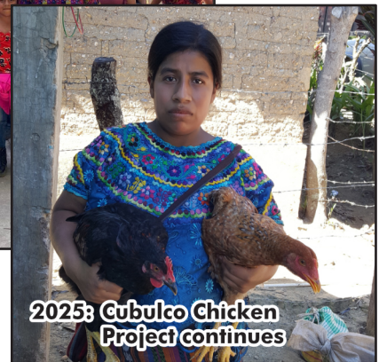
2025: Cubulco Chicken Project continues