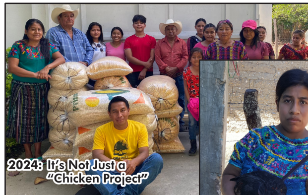
2024: It's Not Just a "Chicken Project"

The Chicken Project continues to be funded by Central Church.