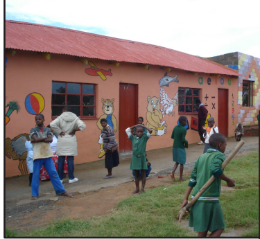
2009: Rachel's Home