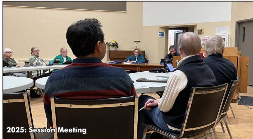
2025: Session Meeting

Having tried various models over the years, Central's Session has chosen one in which elders have a district and serve on one or more teams which oversee the major aspects of congregational life.