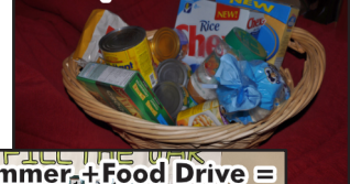
2023: Summer Food Drive = 1 ton of peanut butter