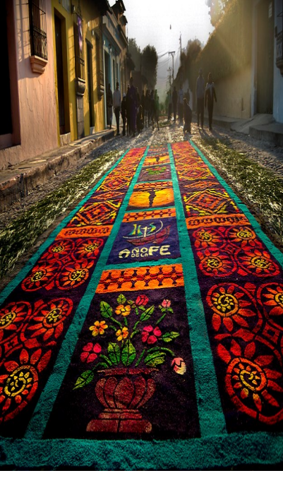
Dyed sawdust carpet in Antigua Guatemala, made during Lent

Hallelujah, he is risen! He is alive, we are alive!